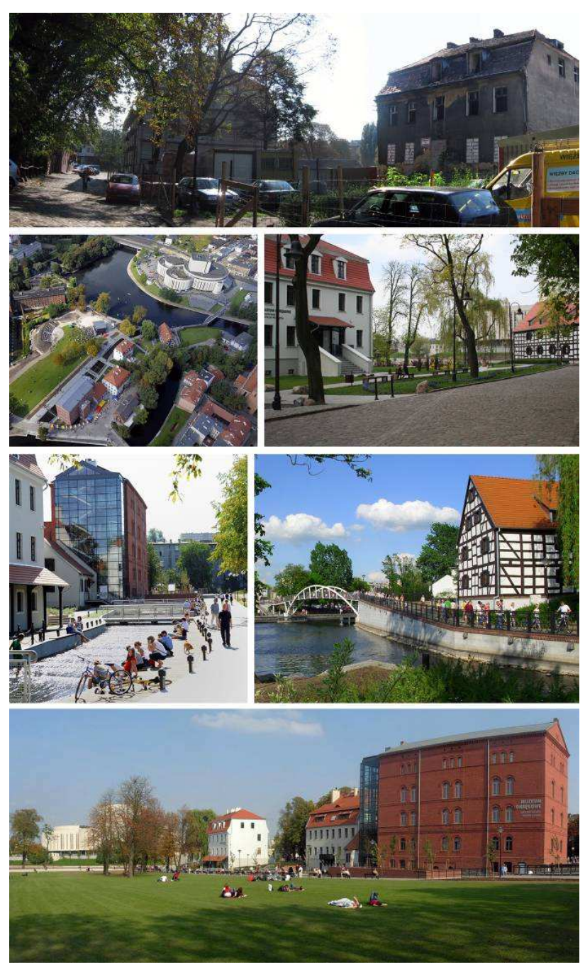
Fig. 2. The Mills Island - state before and after adaptation