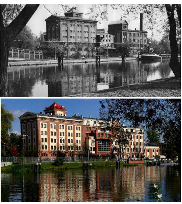
Fig. 1. Kentzer's mills - the state before adaptation, design and the status after adaptation

Mill" according to the design of Futura studio directed by Andrzej Malingowski.